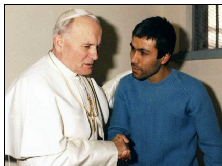
John Paul II forgave Mehmet Ali Agca who shot him on May 13th, 1981