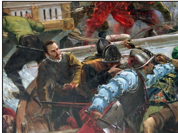
Don Juan during the Battle of Lepanto