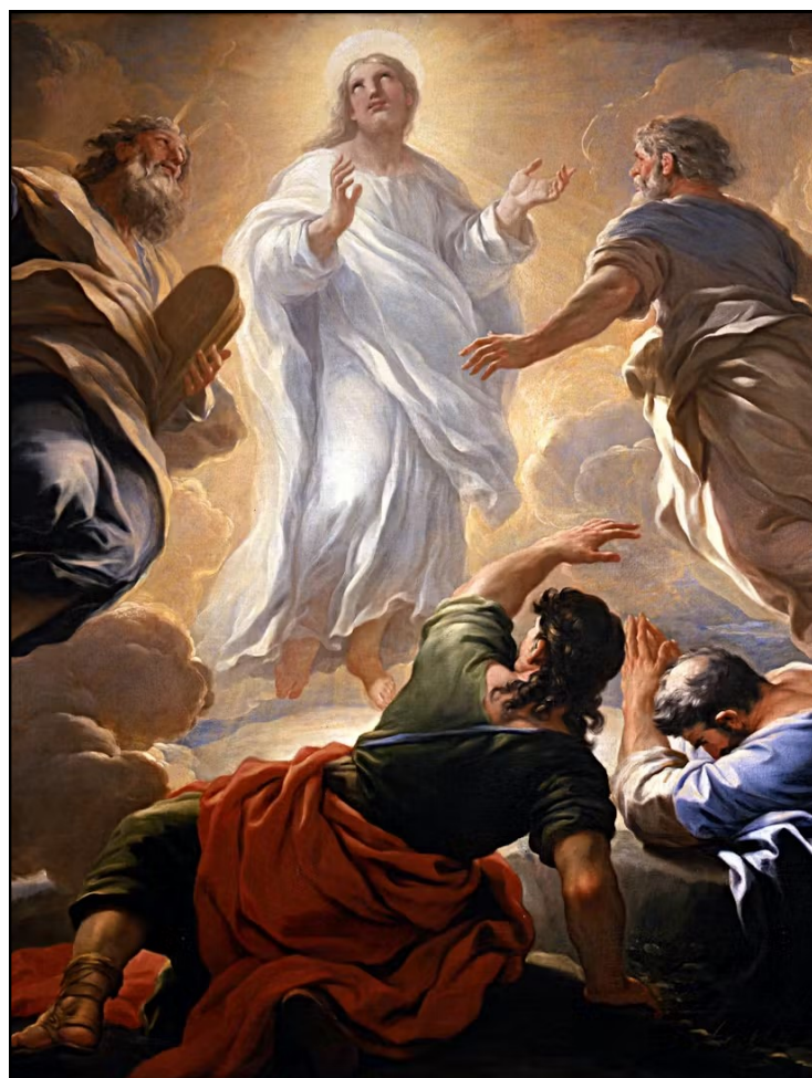
The Transfiguration of the Lord