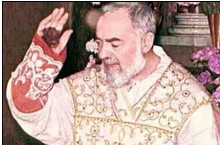
Padre Pio bled from the wounds of Christ for 50 years

“Do you think they're like you, that they don't obey? I couldn't sleep all night because of your angels! Now shut up! When you give your guardian angel a mission, you can be 100 percent sure that he will listen to you and assist you spiritually.” With that, he blessed them and left to celebrate Mass.