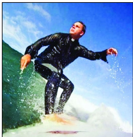
The surfing priest

Peace. That is why I, and also, I think, why other pilgrims came to Medjugorje – to fall in love with Jesus even more and strengthen their hope!