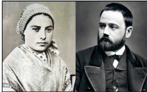
Bernadette of Lourdes and Emile Zola

There was no point of Catholic devotion more ridiculous to him than the belief that the Virgin Mary had appeared in the little French town of Lourdes in 1858 and that miraculous cures had occurred there since then. Zola went to Lourdes in August