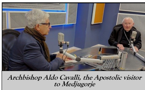
Archbishop Aldo Cavalli, the Apostolic visitor to Medjugorje

(Come to Medjugorje continued on page 6)