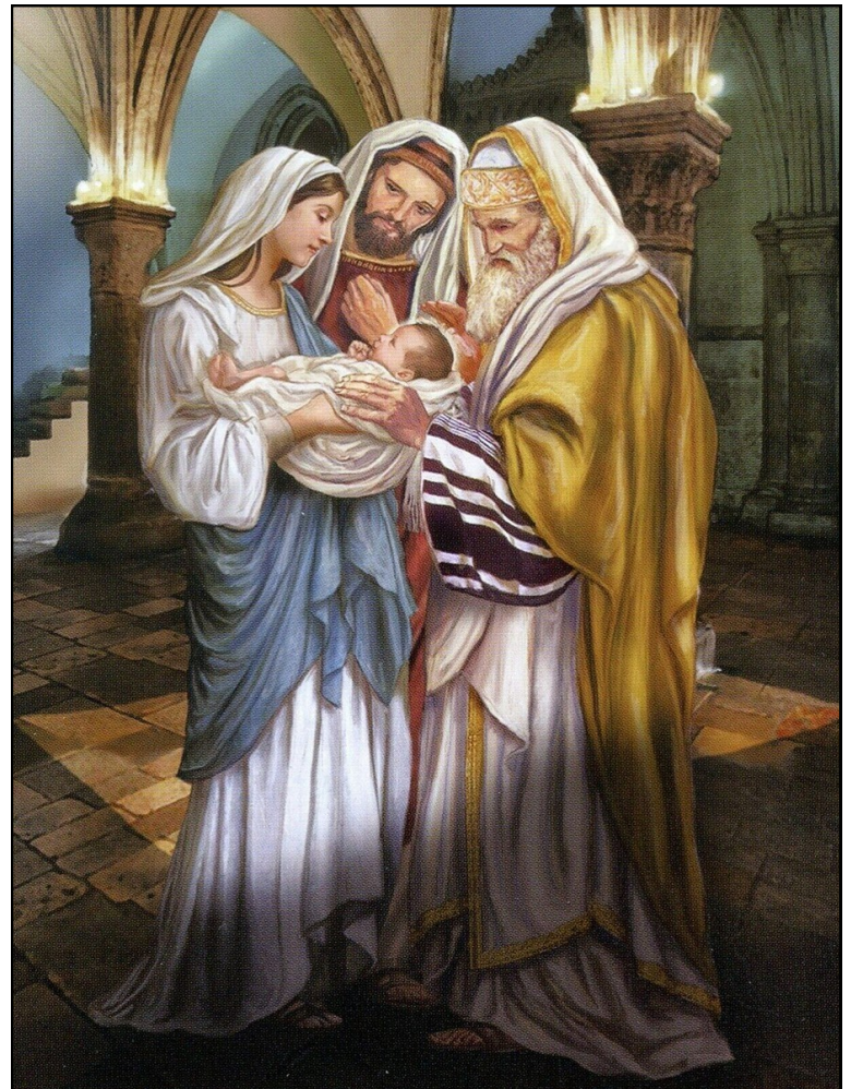
The Presentation of the Lord