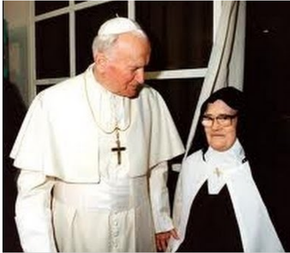
Sr. Lucia of Fatima with John Paul II

Most remarkably, in a second meeting exactly a year later, on October 11, 1993, she reportedly told Cardinal Ricardo Vidal of the Philippines and eight others (including two priests) that “the consecration of 1984 prevented an atomic war that would have occurred in 1985.” She said the Triumph of Our Lady's Immaculate Heart had begun but was an “ongoing process.” As the Irish Democrat noted in a 1993 review of the translator's work, “This 32-page pamphlet detailing a precise and accurate two-hour interview with Sister Lucia in 1992 is a must for all devotees and others interested in the apparitions of Fátima. Clearly from this meticulously recorded interview, many of the abounding theories surrounding these protracted controversies can now be discarded.”