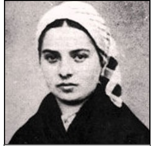
St Bernadette of Lourdes