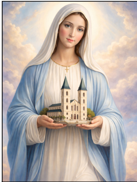
The whole church is summed up in the Blessed Virgin Mary

fore allowed Jesus to touch his heart. Jesus says to him: You will see greater things than these... You will see the heavens open and the Angels of God ascending and descending on the Son of Man (Jn 1:50-51): we can apply these theses words to the apparitions that take place in the world.