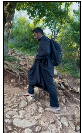
Climbing the hill of Apparitions barefoot

That brings my memory back to India, where Our Blessed Mother appeared and did the miracles. Now, millions and millions of people go there. I remember because I did my high school there. Since I was living there for four years in that place, I could see thousands and thousands of people who are Muslims and Hindus who are not believers of Christ, but they come to ask Our Blessed Mother to intercede for them. They come with great faith and conviction and Our Blessed Mother, and there are lot of miracles that happen. There are thousands and thousands of miracles that happen to Hindus and Mus-